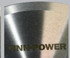
Smooth blade as an option.