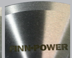
Smooth blade as an option.