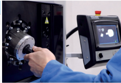
Die sets can be installed into the master dies with a QuickChange-tool one set at a time.