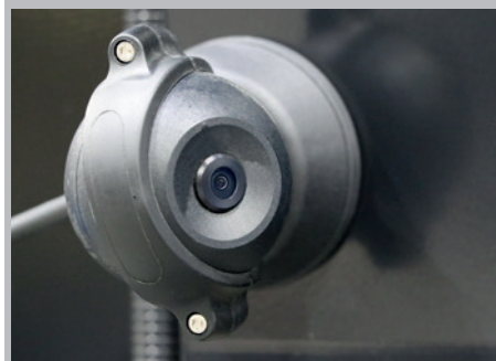
Camera as a standard feature.

Oil Condition Monitor OCM Adapter dies (for 160-series die sets) Oil cooler