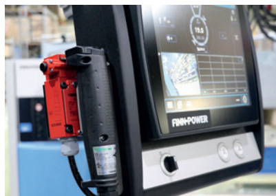
Remote control unit as a standard feature.