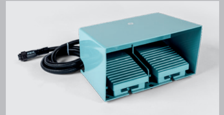
Foot pedal as an option (factory installation only).