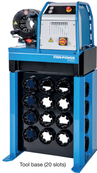
Tool base (20 slots)