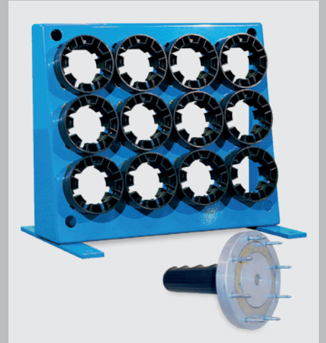
Tool base and Tool rack with QuickChange-tool as an option.