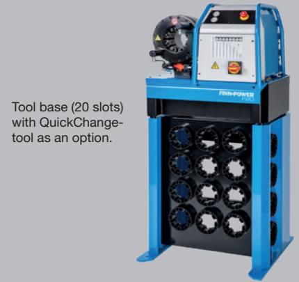
Tool base (20 slots) with QuickChange-tool as an option.