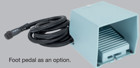
Foot pedal as an option.

Foot pedal Mechanical back stop device Electrical back stop device Tool base (20 slots) with QuickChange-tool Tool rack (16 slots) with QuickChange-tool