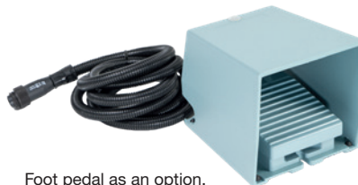
Foot pedal as an option.