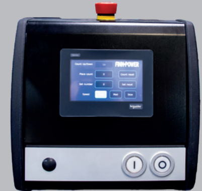
Touchscreen as standard feature